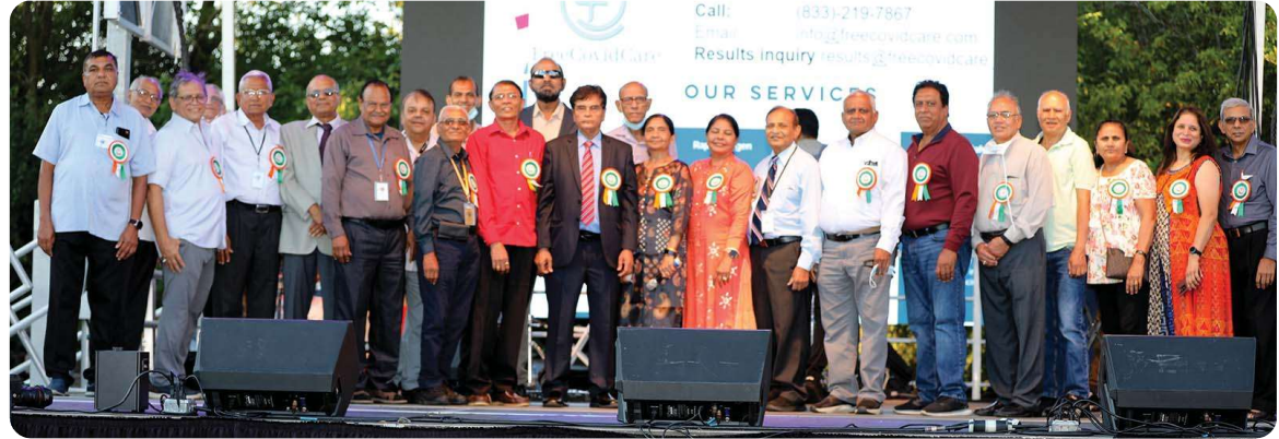
Artists with organizers